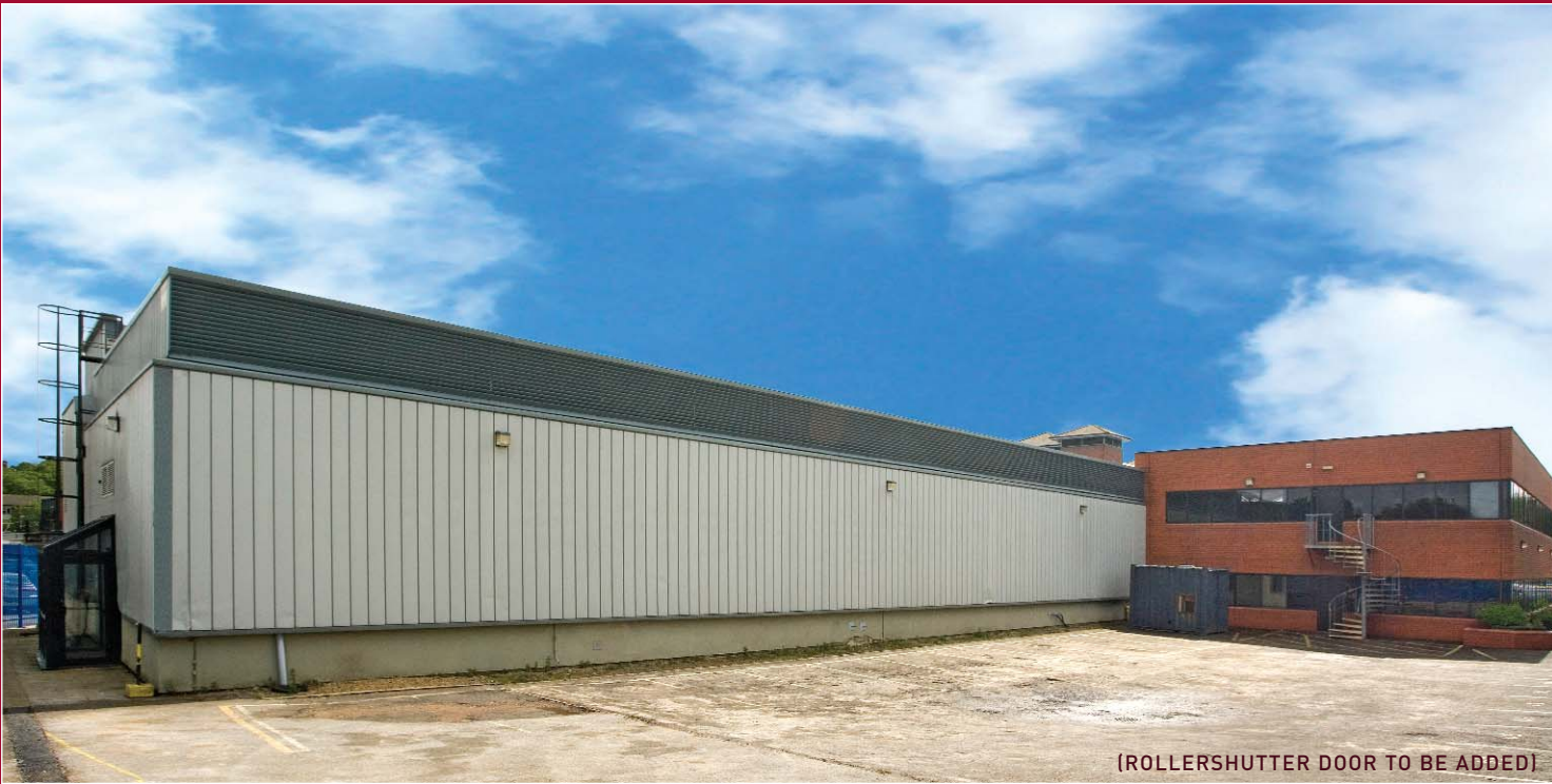
(ROLLERSHUTTER DOOR TO BE ADDED)