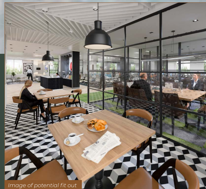
Image of potential fit out